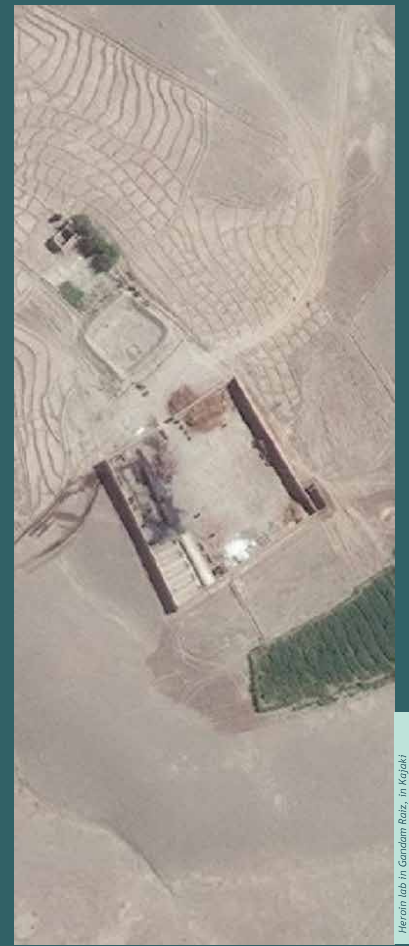
Heroin lab in Gandam Raiz, in Kajaki district, Helmand.