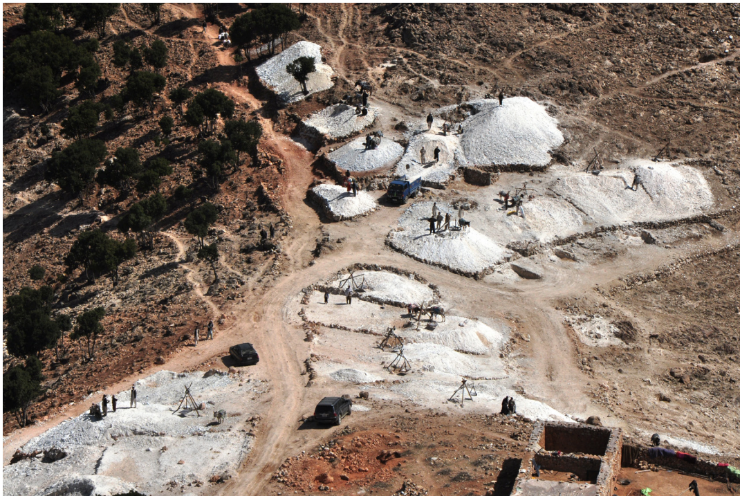
Figure 3: Magnesium Silicate Mines, Mahmand valley, 2014

the associated income. 48 Later, in November 2015, the schools and health clinics in the area were closed and teachers and healthcare professionals were told that, while they could work privately, they would be punished if they accepted a government salary. Finally, the magnesite mines in upper Achin have also closed, imposing a further cost on the local population. 49