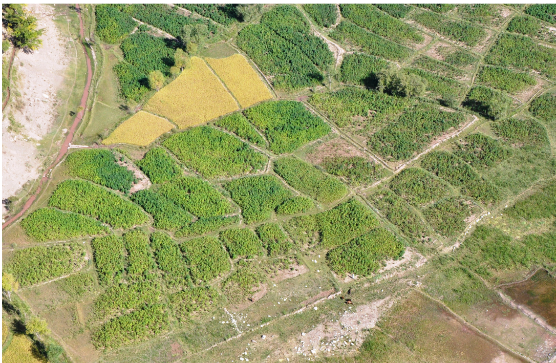
Figure 1: Widespread marijuana cultivation in Hisarak, Nangarhar

long conflict 3 . These have largely followed incursions by militants fighting under the banner of Islamic State (IS), known locally as Daesh. The Taliban and Daesh are now engaged in a fight over territory in the southern districts bordering Pakistan; a fight that has also led to the formation of an armed militia that, until recently, completely bypassed the central government and linked rural elites from the upper valleys of Achin 4 with the parliamentarian and deputy speaker of the Wolesi Jirga, Hajji Zahir Qadir. 5 This same militia stands accused of beheading Daesh fighters and mounting their heads by the roadside in Achin in revenge for the execution of their comrades. 6