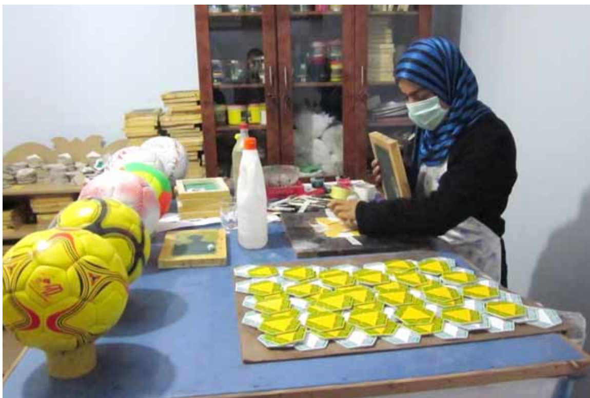
Female factory worker making footballs in Kabul

For women-led businesses, existing challenges are exacerbated by social limitations. Their gender makes access to markets and credit, where property documents are often required for loan insurance, more complicated. Illiteracy and lack of capacity are also key issues. Economic policy-making remains dominated by men and women are not represented in decision-making trade institutions, such as the Chamber of Commerce and Industry and the Afghanistan Investment Support Agency.