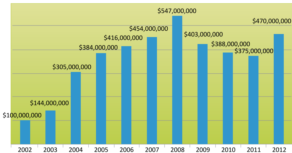
Figure 1: Afghanistan's Export Statistics