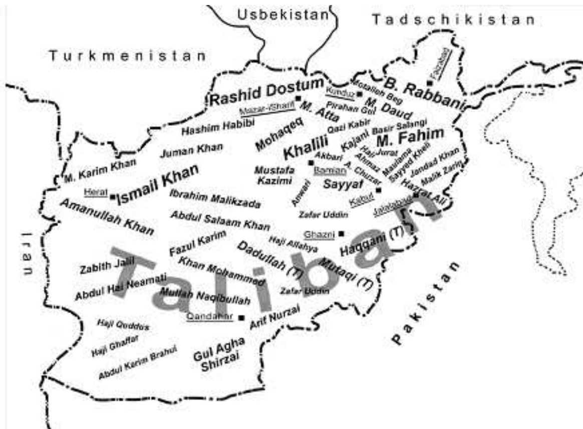
Reprinted with permission.

The site can be accessed at: http://www.ucl.ac.uk/dpu-projects/drivers_urb_change/home.htm